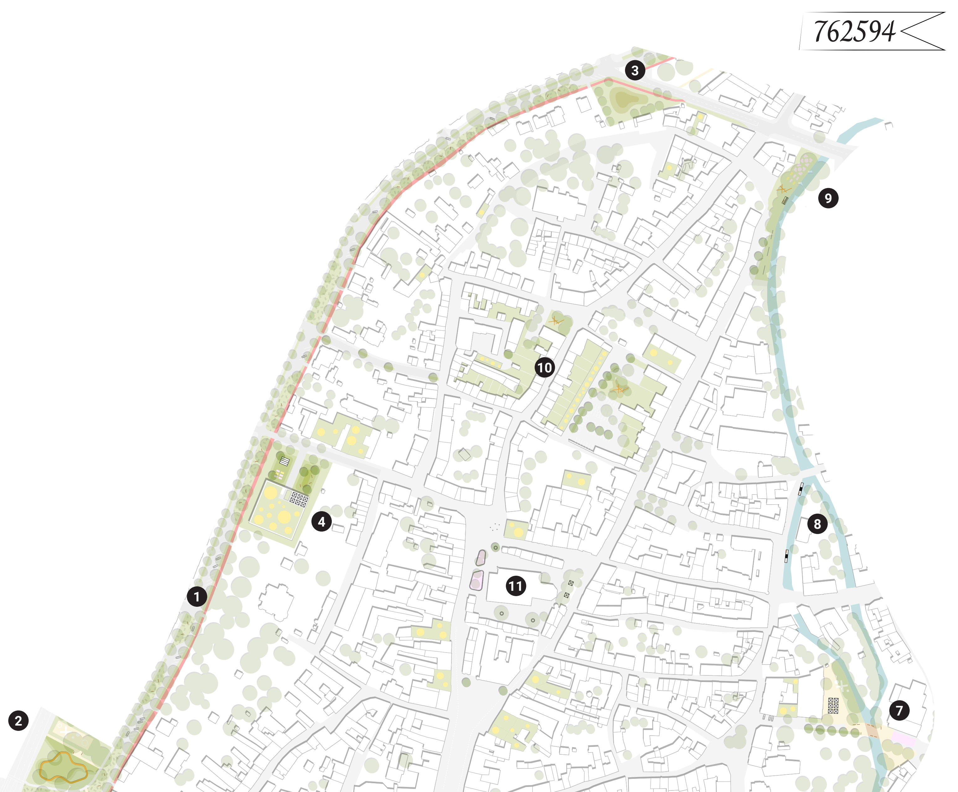
1,2,3,4 - WallIstraße, Weststraße park, the north of Wallstraße, Parking garage

5,6 - Wordgarden and parking lots on Carl-Ritter-Straße